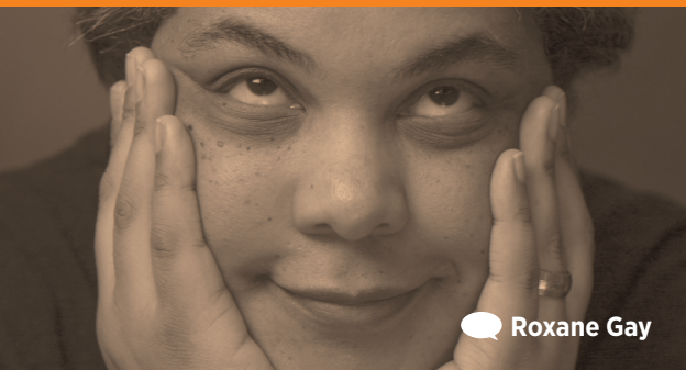
🗨 Roxane Gay